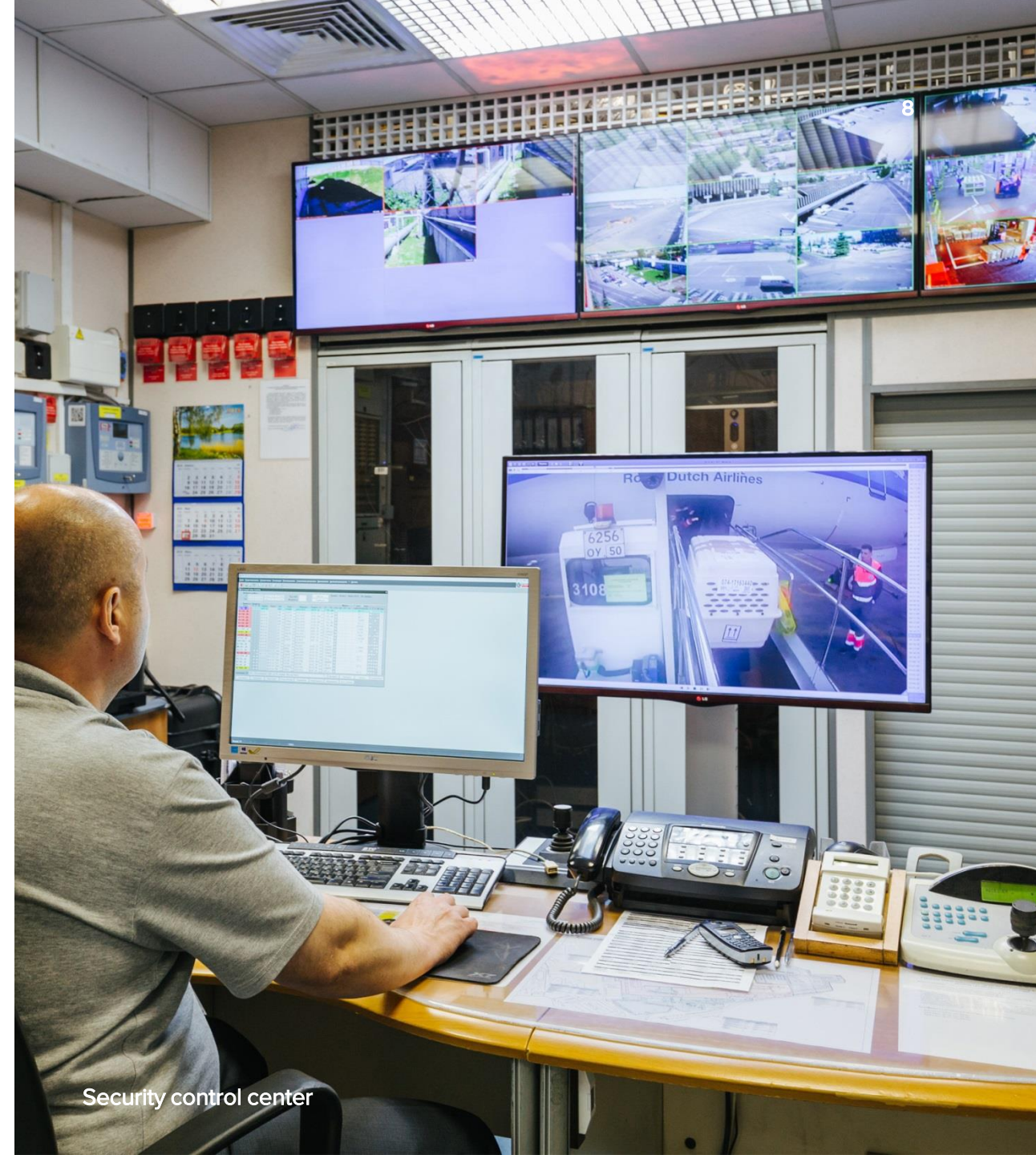
Security control center