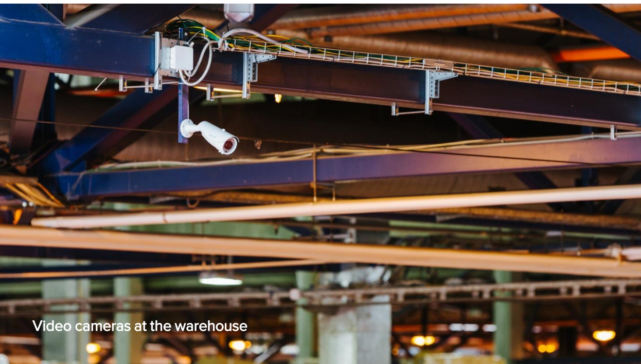
Video cameras at the warehouse